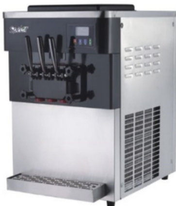
TABLE TOP SOFTY MACHINE

size: 540×615×1410mm Power: 2Kw Output: 25-30L