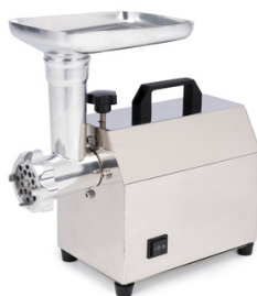
MEAT MINCER 12 Capacity: 120kg/hr power: 850W