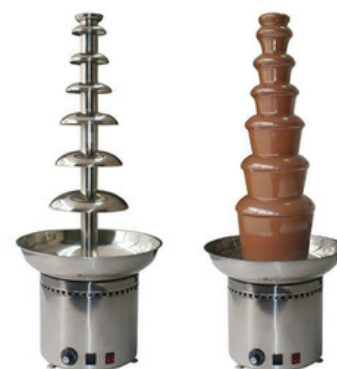
CHOCOLATE FOUNTAIN 5 TIER