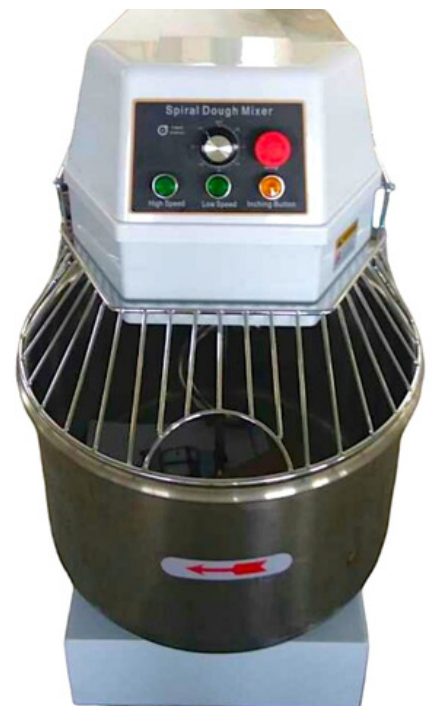
SPIRAL MIXER 60

cap.: 50Ltrs. Power: 2.8Kw, 380v Max Kneading: 20Kgs