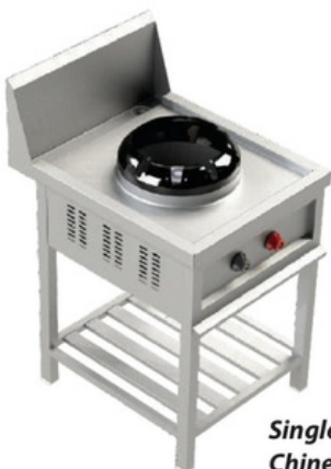
Single Burner Chinese Range