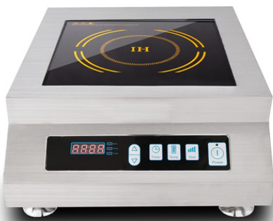
SQUARE INDUCTION COOKER size: 450×350×200mm Power: 5000W