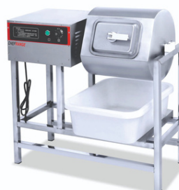
SALTING MACHINE W/VACCU 35 LTR Size: 710 x400 x830 capacity: 35ltr Power: 350