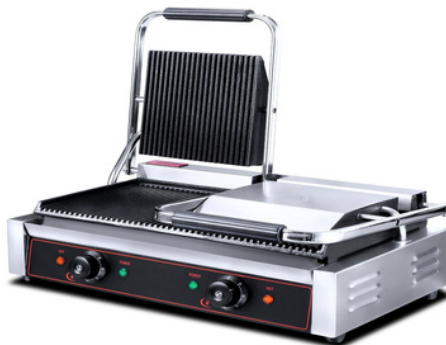
DOUBLE JUMBO CONTACT GRILL Size: 820×395×190mm Power: 2.2Kw × 2