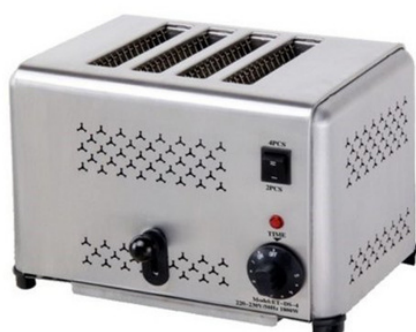
4 SLICE TOASTER