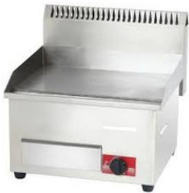
GAS GRIDDLE Size: 550 x514 x540 Type: Gas