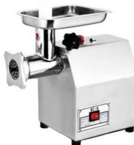
MEAT MINCER 22 Capacity: 120kg/hr power: 1.1KW