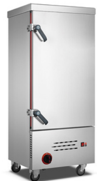
RICE STEAMER 12 TRAY Dia: 720×640×1550mm Power: 12Kw