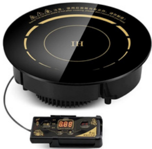
ROUND INDUCTION COOKER 220-240V, 2200Watts Size Ø285mm