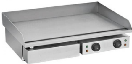
ELECTRIC GRIDDLE Size: 550×450×235mm Power: 3Kw