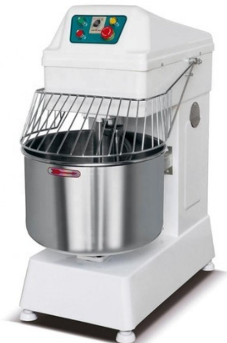
SPIRAL MIXER 50

cap.: 40Ltrs. Power: 2.2Kw Max Kneading: 16Kgs