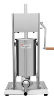
SAUSAGE FILLER 7LTR Size: 300 x300x795 capacity: 7ltr.