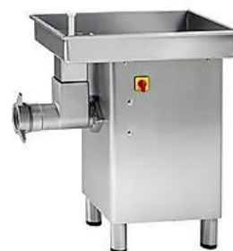
MEAT MINCER 32 Capacity: 400kg/hr power: 1.5kw