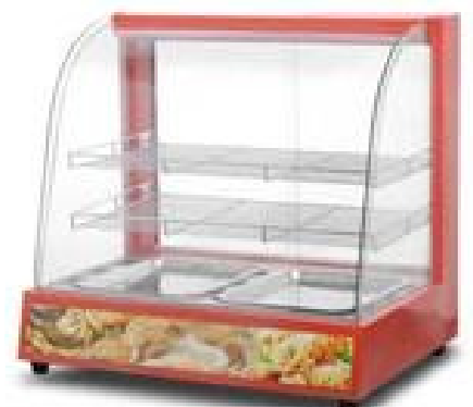
SQUARE INDUCTION COOKER size: 450×350×200mm Power: 5000W