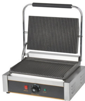
JUMBO CONTACT GRILL Size: 425×370×190mm Power: 2.2Kw