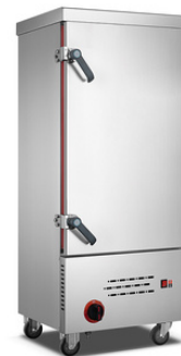
RICE STEAMER 8 TRAY Dia: 720×640×1170mm Power: 9Kw