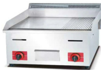
GAS GRIDDLE Size: 550×514×540mm Type: Gas