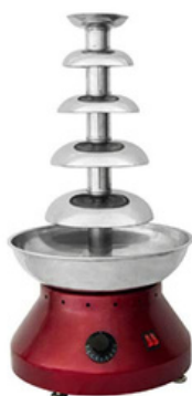
CHOCOLATE FOUNTAIN 5 TIER