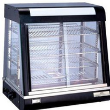
SQUARE INDUCTION COOKER size: 450×350×200mm Power: 5000W