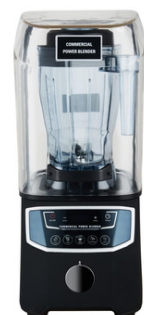
BAR BLENDER Cap: 1.5ltr Power: 3Hp