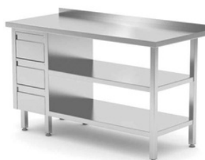
SS WORK TABLE WITH 3 DRAWERS AND UNDERSHELVES