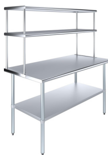
PICKUP COUNTER WITH UNDERSHELF AND 2 OVERHEAD SHELF