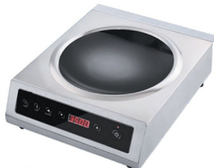
COMMERCIAL INDUCTION COOKER size: 415×326×110mm Power: 3500W