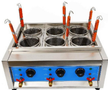
PASTA BOILER 6 COMPARTMENT Size: 210×190×130mm Power: 6Kw