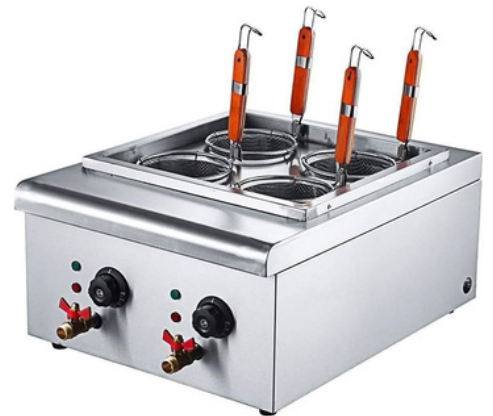
PASTA BOILER 4 COMPARTMENT Size: 180×180×130mm Power: 4Kw