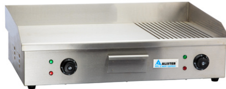
ELECTRIC GRIDDLE Size: 550×450×235mm Power: 3Kw