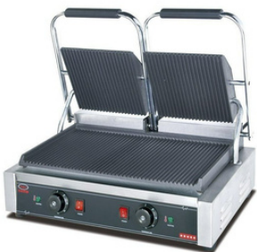
DOUBLE CONTACT GRILL Size: 565×370×190mm Power: 1.8Kw × 2