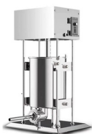
SAUSAGE FILLER 10LTR Size: 420x310x660mm Cap.: 10Ltrs.