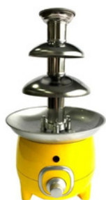
CHOCOLATE FOUNTAIN 3 TIER