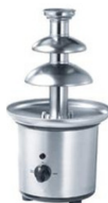
CHOCOLATE FOUNTAIN 3 TIER