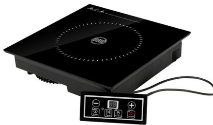
SQUARE INDUCTION COOKER 20-240V, 2200Watts Size (L)300×(W)300