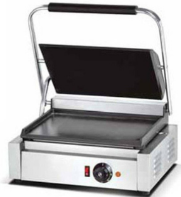
JUMBO PANINI GRILL size: 410×305×210mm Power: 2.2Kw