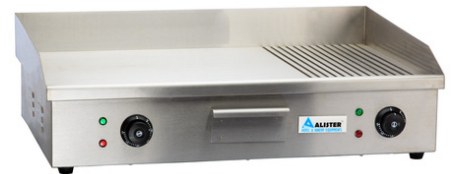
ELECTRIC GRIDDLE Size: 730×520×235mm Power: 4.4Kw