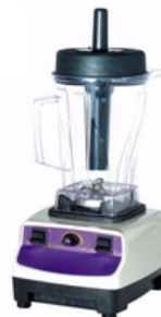
BAR BLENDER Cap: 1.5ltr Power: 3Hp