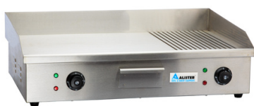
ELECTRIC GRIDDLE Size: 730×520×235mm Power: 4.4Kw