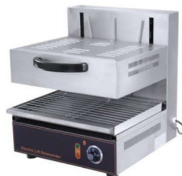
ELECTRIC SALAMANDER LIFT