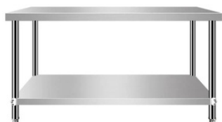
SS WORK TABLE WITH UNDERSHELF