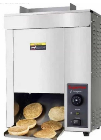
VERTICAL BUN TOASTER