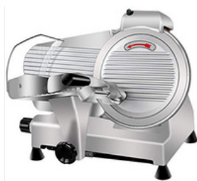
MEAT SLICER 250MM Size: 575 x465 x415mm capacity: 35ltr power 150W