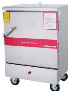
RICE STEAMER 4 TRAY Dia: 700×600×810mm Power: 1.1Kw