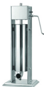
SAUSAGE FILLER 3LTR Size: 300 x235x600 capacity: 5ltr Power: 1kw