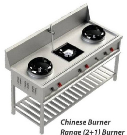
Chinese Burner Range (2+1) Burner