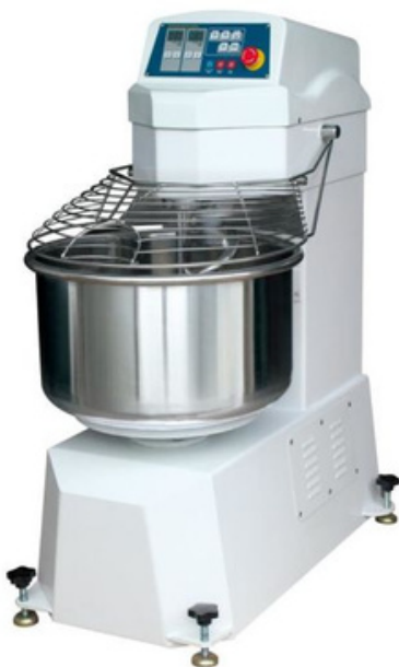
SPIRAL MIXER 40

Cap.: 30Ltrs. Power: 1.5Kw Max Kneading: 12Kgs