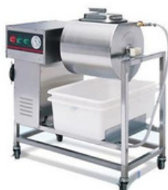
SALTING MACHINE W/VACCU 35 LTR Size: 710 x400 x830 capacity: 35ltr Power: 350