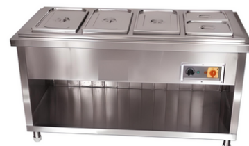
STAINLESS STEEL HOT/ COLD BAINMARIE

Size: Customised as per customer's requirement