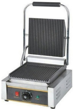
SINGLE CONTACT GRILL Size: 370×305×190mm Power: 1.8Kw