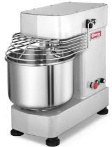
SPIRAL MIXER 30

Cap.: 20Ltrs. Power: 1.1Kw Max Kneading: 8Kgs