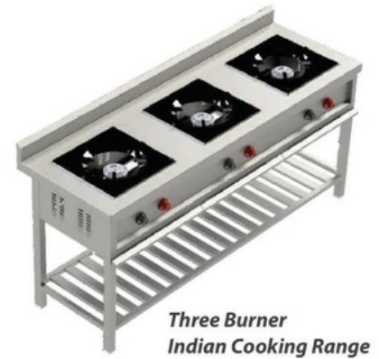
Three Burner Indian Cooking Range