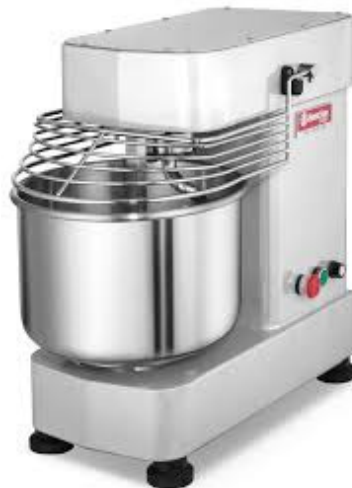
SPIRAL MIXER 20

Cap.: 10Ltrs. Power: 0.75Kw Max Kneading: 4Kgs