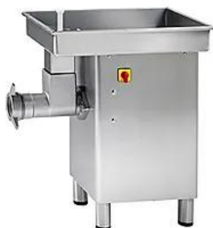
MEAT MINCER 42 Capacity: 600kg/h power: 3kw