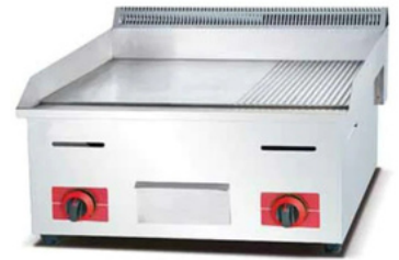
GAS GRIDDLE Size: 730×565×540mm Type: Gas