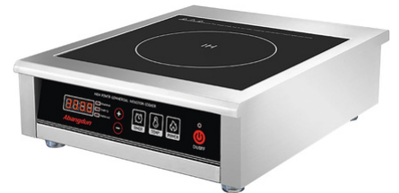
COMM. INDUCTION COOKER (BUILT IN) size: 400×400×180mm Power: 3500W