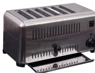
6 SLICE TOASTER