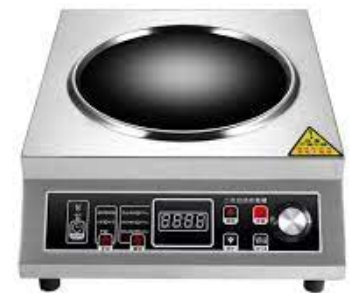
COMMERCIAL INDUCTION COOKER, WOK size: 415×326×110mm Power: 5000W