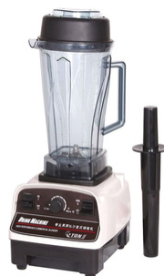
BAR BLENDER Cap: 2ltr Power: 2Hp