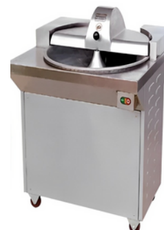
BOWL CHOPPER Size: 605 x462 x500mm capacity: 5ltr Power: 550W